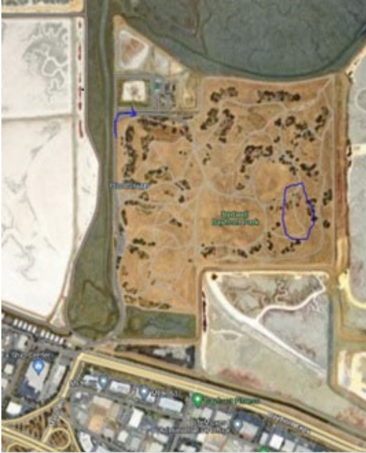
Fig. 1 Bidwell Bayfront Park in Menlo Park.

teer to be the logger for an operator. The logger assists the operator by logging the contacts. This is a great way to get up to speed on operating a contest and on HF.