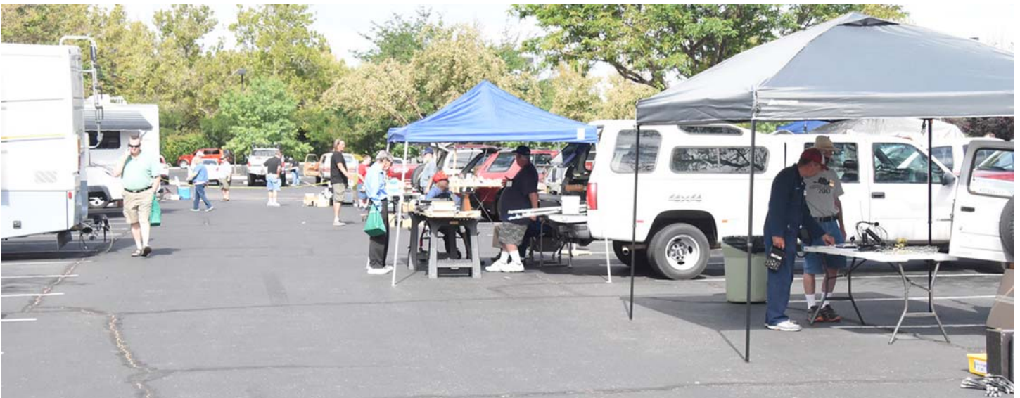
Above—Flea Market at Duke City Hamfest