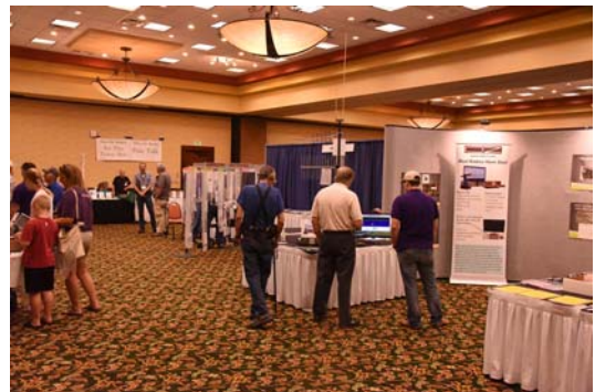
Vendor Hall (President — Continued on page 7)