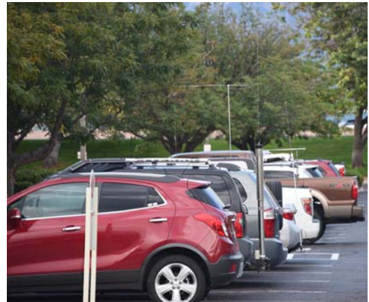
Faithful Steeds waiting for Communicators