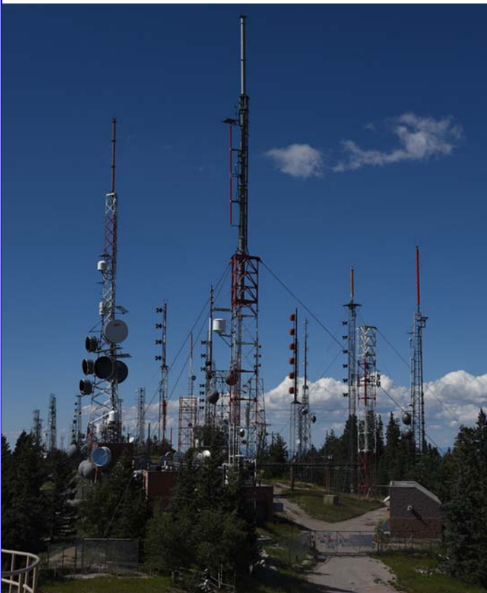
Sandia Crest (near Albuquerque) Communication Hill