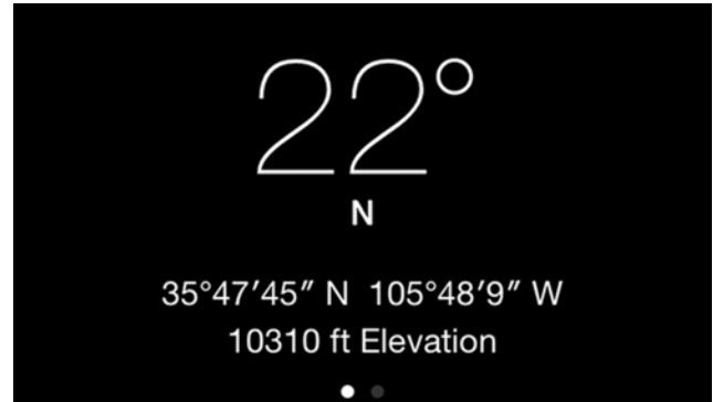
Ski Santa Fe's Elevation Santa Fe's Elevation is about 7100 ft.

Here are some random pictures from the Duke City Hamfest (more may be seen at: k6wx.smugmug.com/Travel/Santa-Fe-8-2015/ ):