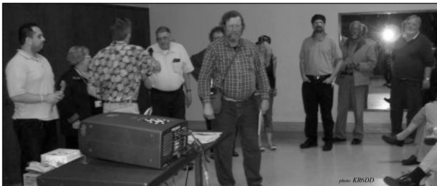
April Raffle Ticket Pullers