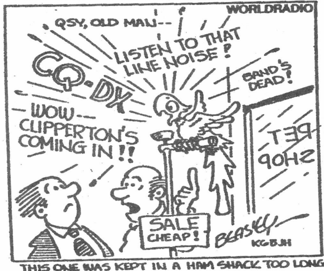
THIS ONE WAS KEPT IN A HAM SHACK TOO LONG